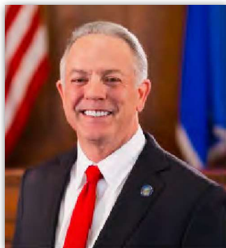
Governor Joe Lombardo STATE OF THE STATE ADDRESS

“OUR CAPACITY TO ACHIEVE GREAT DEEDS WILL NEVER BE IN QUESTION, BECAUSE WE WILL FOLLOW THE NEVADA WAY – NEVER GIVE UP, NEVER GIVE IN, AND NEVER STOP DREAMING.”